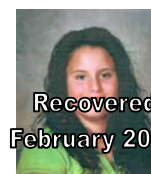
Recovered February 2008